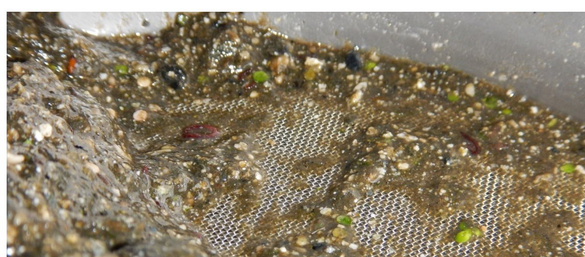
Fig. 1: Solid residues of clean WWTP-effluent (waste water treatment plant), separated on-site from 500 m³ of WWTP-effluent by 250 µm mesh net.

Step 1. Take a representative water sample incl. solids that are potentially microplastics. Make sure the particle size you are interested in is not already excluded by the sampling method, i.e. prefilters of pumps, small hose diameter, inappropriate mesh size.